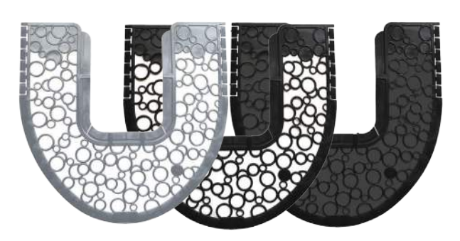
Keeps floors clean around toilets and urinals