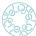
Easy Fresh Room air-freshener